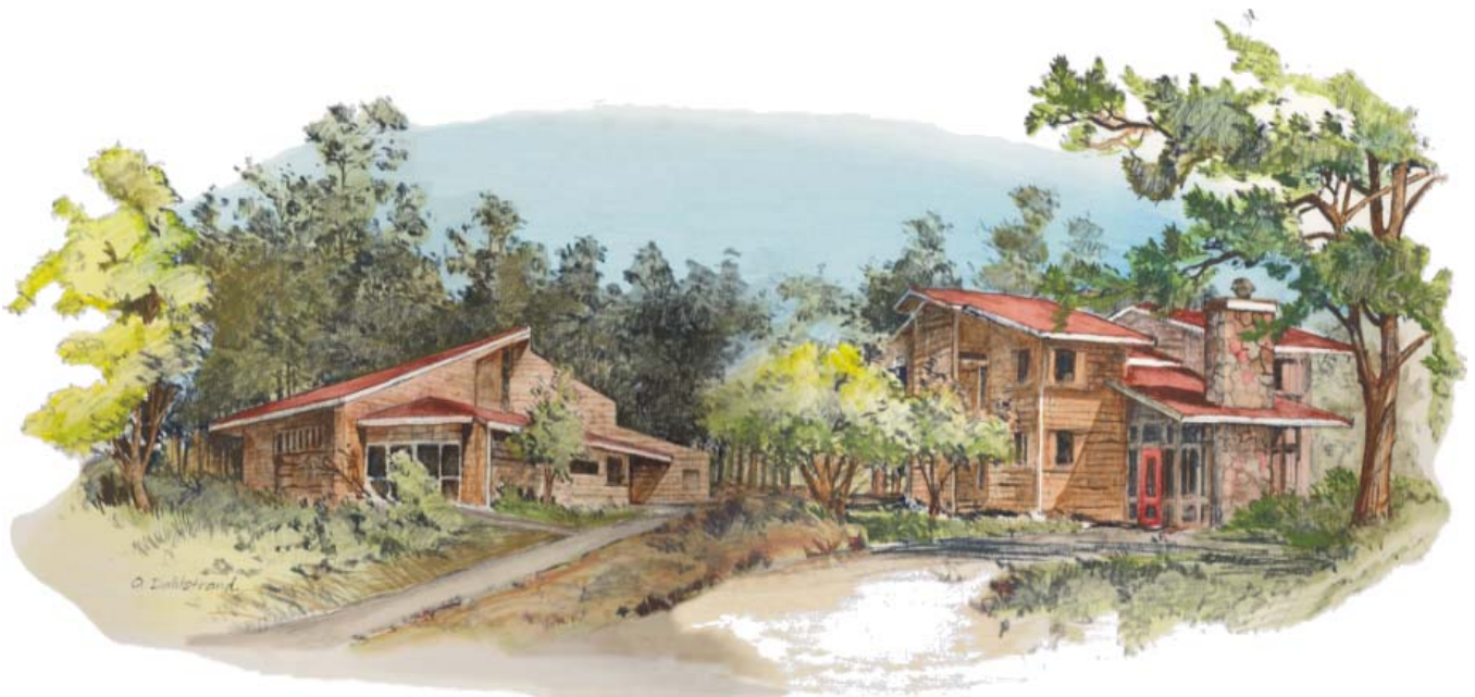
William Penn Mott Jr. Training Center